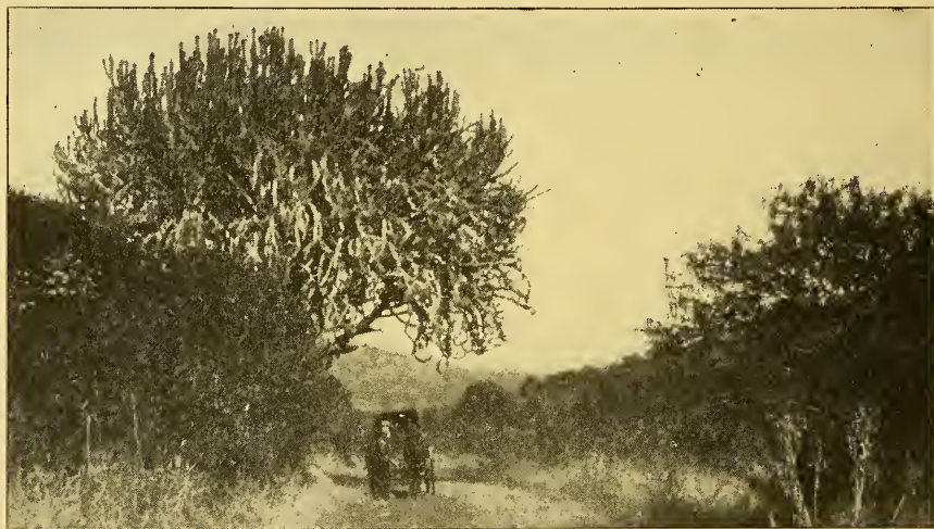
AN AFRICAN TRAVELER

She was beautiful. She was a great huntress, and her fame was in the mouth of Europe. Her husband was a patient man, or he never would have been persuaded to tag after lions in an African jungle. He preferred trapping Greek verbs in an unabridged lexicon. But perhaps he wanted his beautiful wife to forget the tiny, choking wail that haunted his own ears after months—and months—